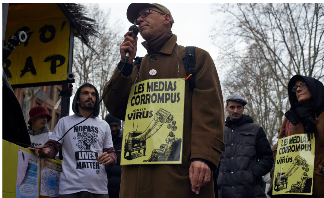
Wearing a placard that reads "The corrupt media are the virus," a protester against France's COVID-19 health pass addresses a crowd in Toulouse, France, in January 2022.

News organizations have increasingly found themselves in the crossfire of populist politics, which capitalize on antiestablishment frustrations and people's distrust of traditional institutions, including the media. 55 In Germany, despite high levels of overall trust in traditional media, distrust in "Systemmedien" ("media of the system," a pejorative term for public broadcasters) has coincided with the rise of the far-right party Alternative for Germany (AfD), which is especially strong in the eastern states. 56 AfD has