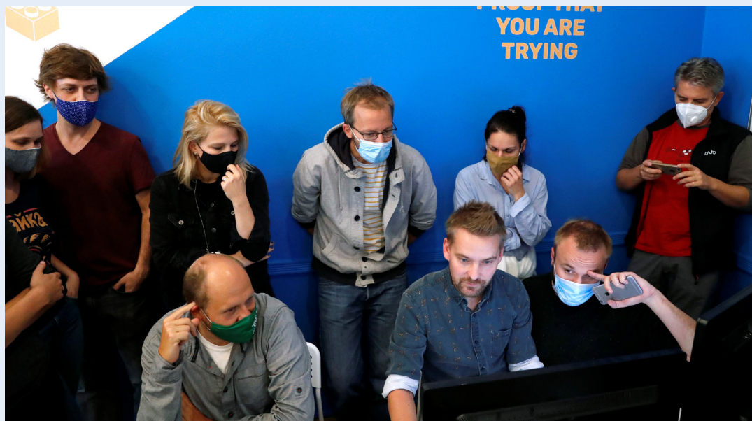
Founding members gather to launch the independent news website Telex in Budapest, Hungary, in October 2020.

Independent radio station Klubrádió started appealing to its audience for funding in 2012, when revenues fell dramatically after government interference with its broadcasting license made it difficult for the outlet to attract advertisers. When the national regulator eventually revoked the license in 2020 and forced it off the air in 2021, Klubrádió urged its