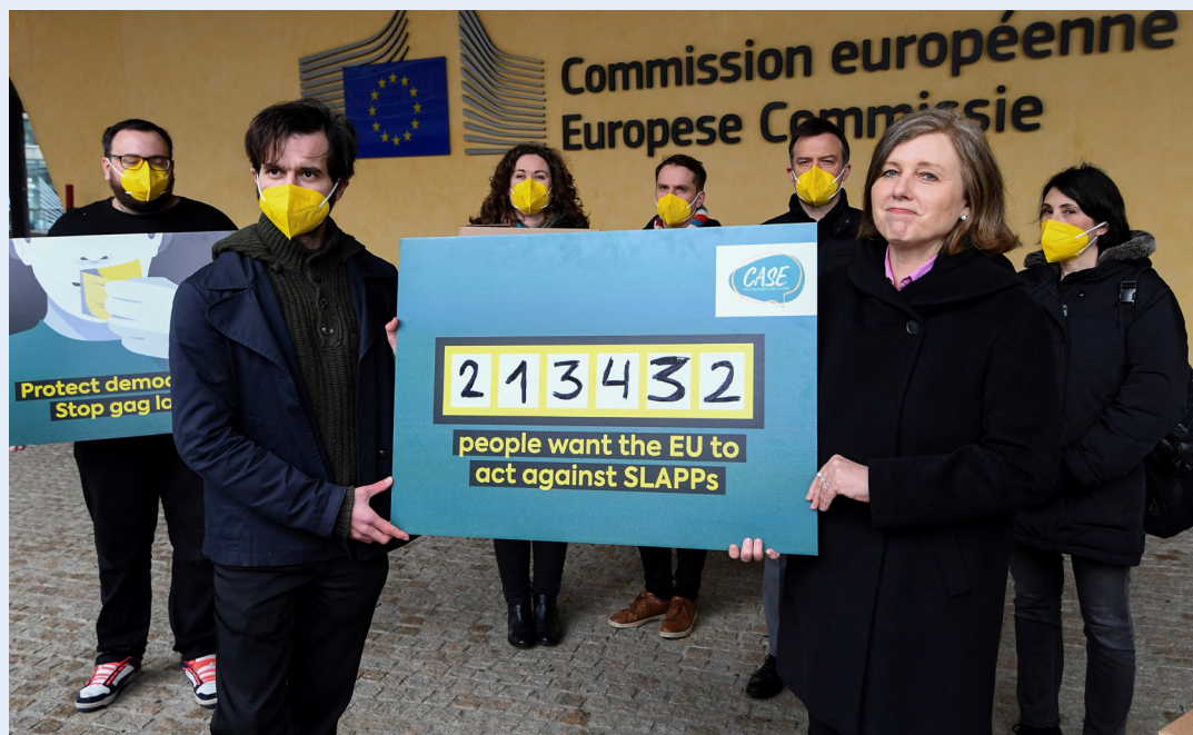
Representatives of the Coalition against SLAPPs in Europe (CASE) deliver a petition to the European commissioner for values and transparency, Vera Jourova, calling for an EU directive against SLAPP lawsuits, in Brussels, Belgium, in February 2022.