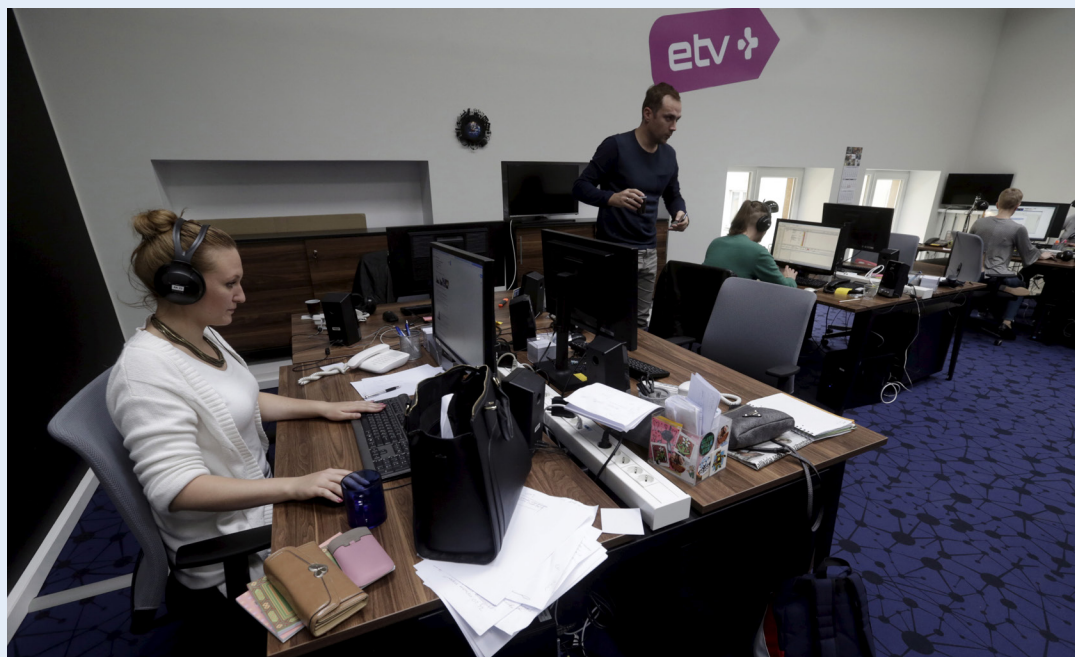
Journalists work in the editorial office of the Russian language television channel ETV+ in Tallinn, Estonia, in September 2015.

- Günter Bartsch, Netzwerk Recherche in Germany