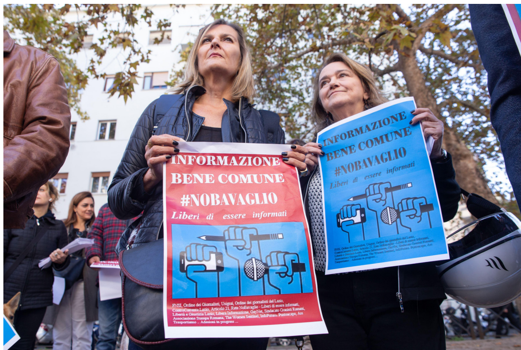
Italian journalists demonstrate against gag lawsuits in front of a court in Rome, Italy, in November 2022.