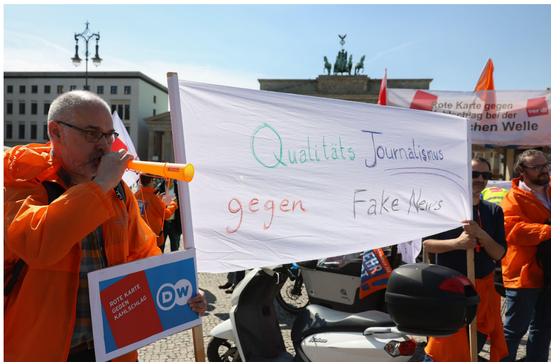
Deutsche Welle employees hold a demonstration against the international public broadcaster's cost-cutting plans in Berlin, Germany, in May 2023.

The democratic consequences are even more acute when media ownership becomes captured by ruling-party interests. The departure of foreign investors in less favorable environments can create a vacuum that leaves more space for government-friendly actors to enter the scene. In Hungary, a series of media takeovers by wealthy businesspeople aligned with the ruling party, Fidesz, has enabled an unaccountable government to flourish by dominating media at the local and national level. In an unprecedented move in late 2018, hundreds of progovernment media outlets, including newspapers and television and radio stations merged under a nonprofit conglomerate called the Central European Press and Media Foundation (KESMA). The government declared the merger to be of “national strategic importance” to exempt it from competition laws. 10