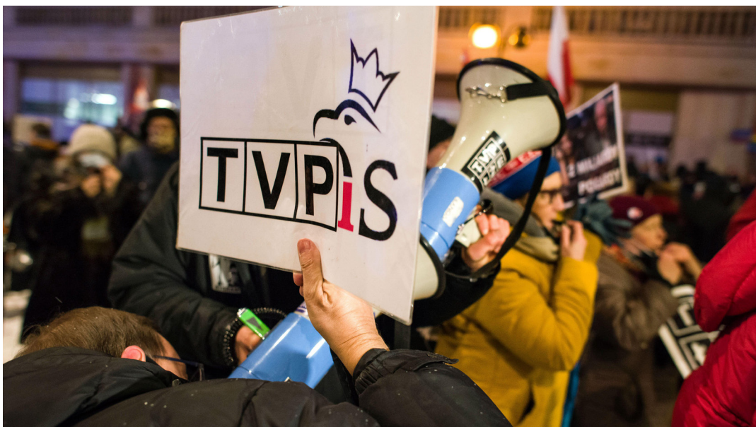
A protester holds a placard with the symbol of Poland's ruling party Law and Justice (PiS) pasted onto the logo of public television broadcaster TVP at a demonstration against a proposed media advertising tax in Warsaw, Poland, in February 2021.