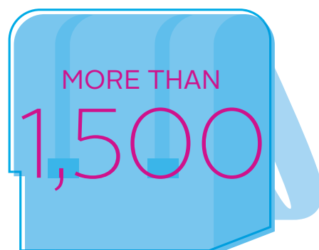
SCHOOLS were reached through our projects in 2017