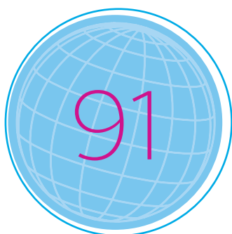
INTERNATIONAL PARTNERS cooperated with us in 2017