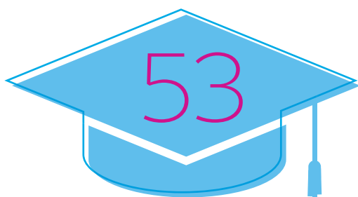
UNIVERSITIES worked with us in 2017